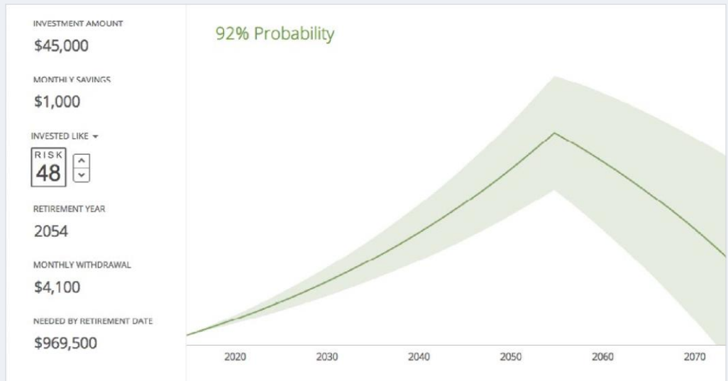
Screenshots: Risk Number® and sample six-month 95% probability range (left), and a sample Retirement Map (right).

IMPORTANT: The projections or other information generated by Riskalyze regarding the likelihood of various investment outcomes are hypothetical in nature, do not reflect actual investment results and are not guarantees of future results.